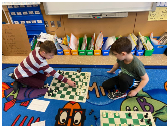
Students in Chess Club are learning the game.